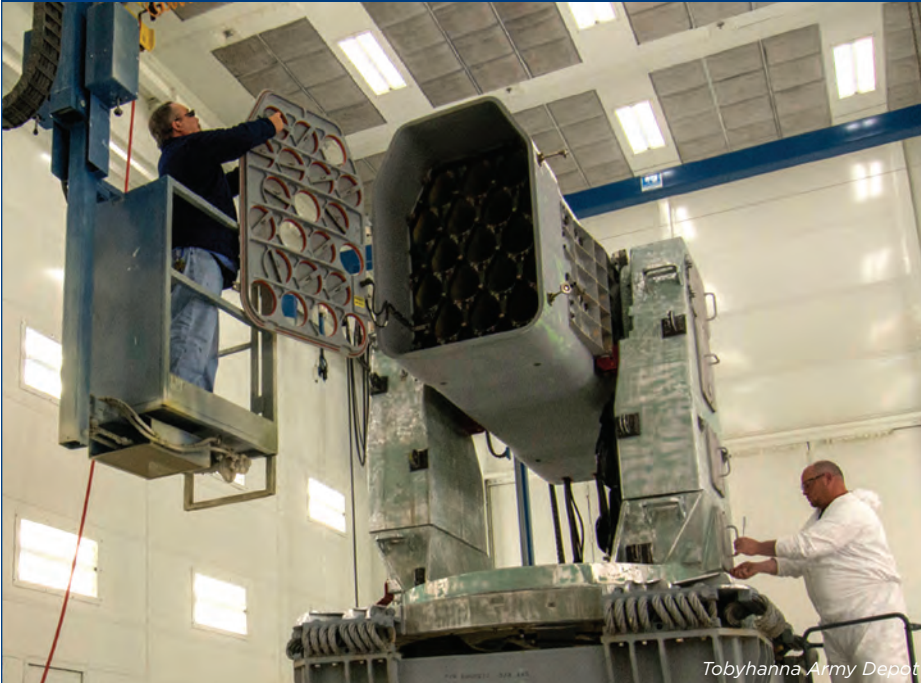
Tobyhanna Army Depot